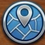
Movement geo fence