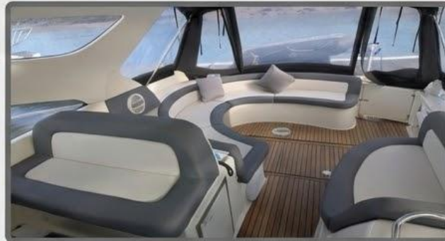
Premium Two-Tone Seating & Retrimmed Panels.