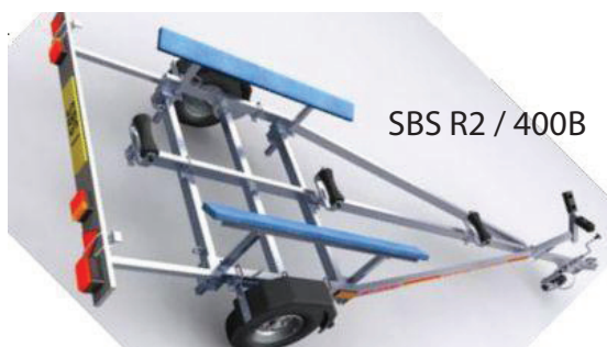
SBS R2 / 400B