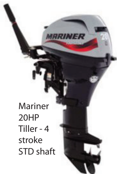
Mariner 20HP Tiller - 4 stroke STD shaft